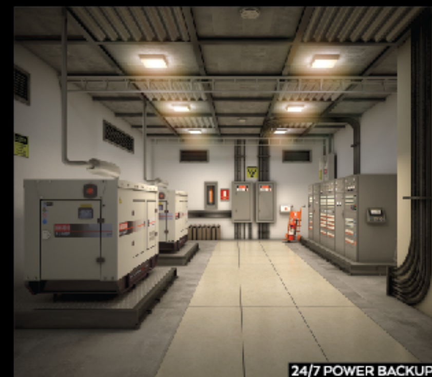
24/7 POWER BACKUP